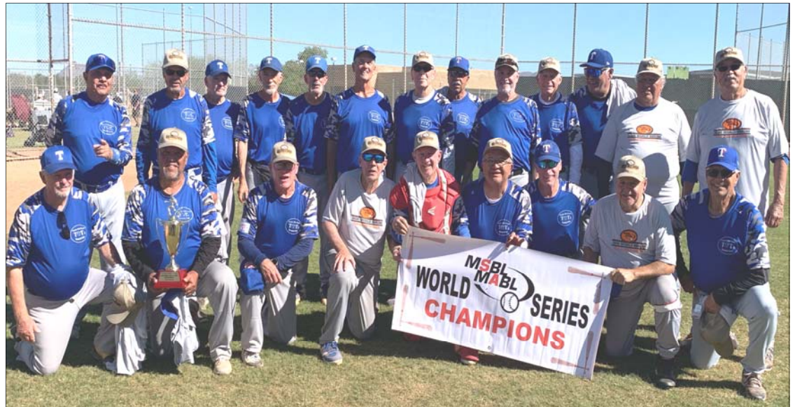
73+ American Champions - Tucson Oldtimers