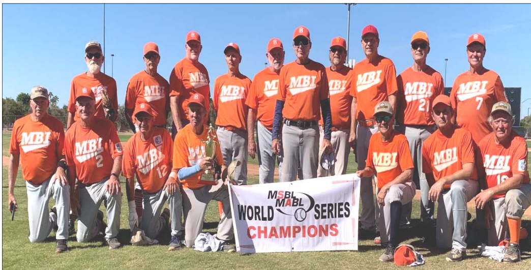
73+ National Champions - MBI