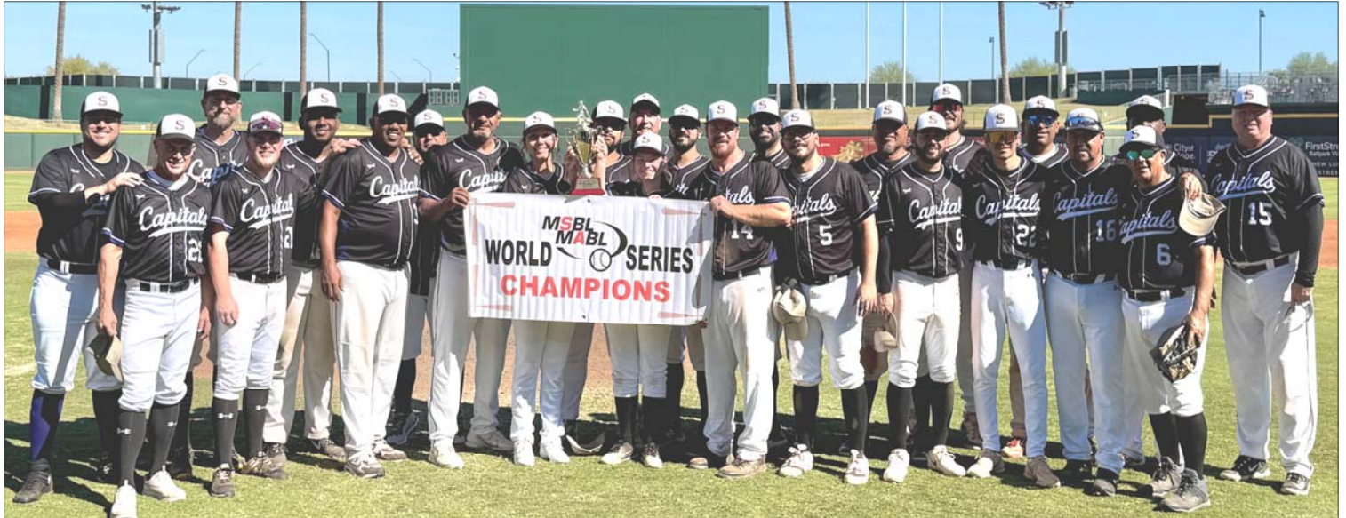
Father and Son National Champions - Sacramento Capitals