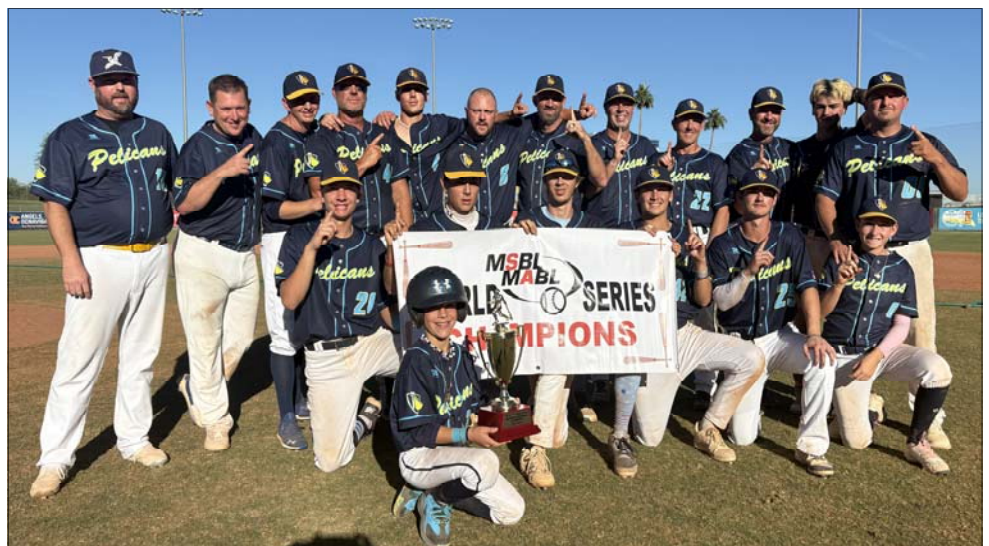
Father and Son Desert Champions - Utah Pelicans