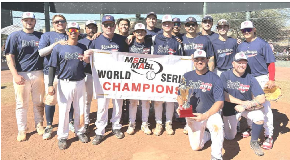
Father and Son Zona Champions - Heritage Baseball