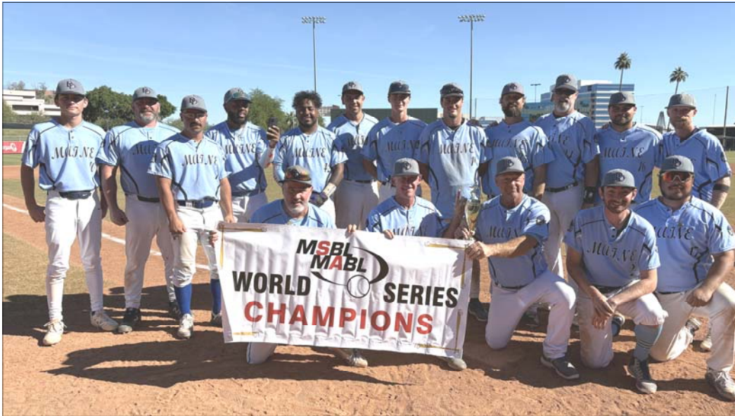
Father and Son Cactus Champions - Maine Diamond Dogs