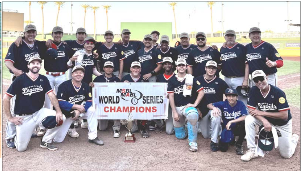
Father and Son American Champions - San Diego Legends