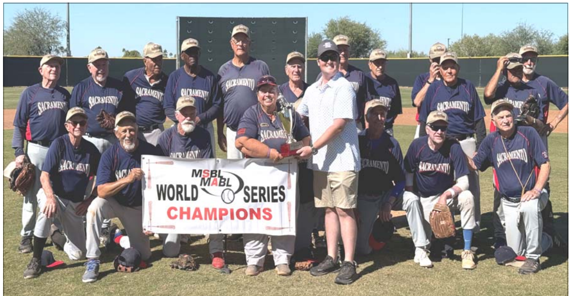
80+ National Champions - Sacramento Solons