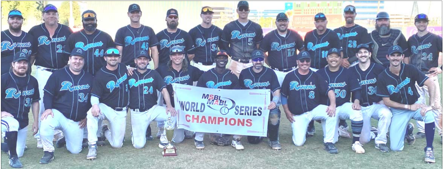
35+ Cactus Champions - Seattle Ravens