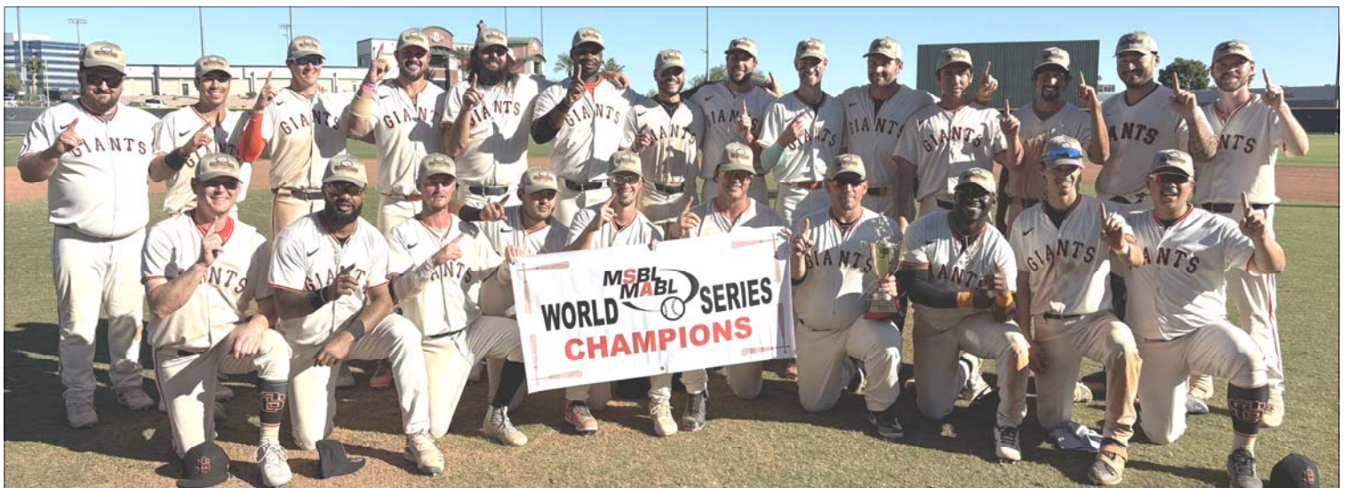
25+ Cactus Division Champions - Seattle Giants