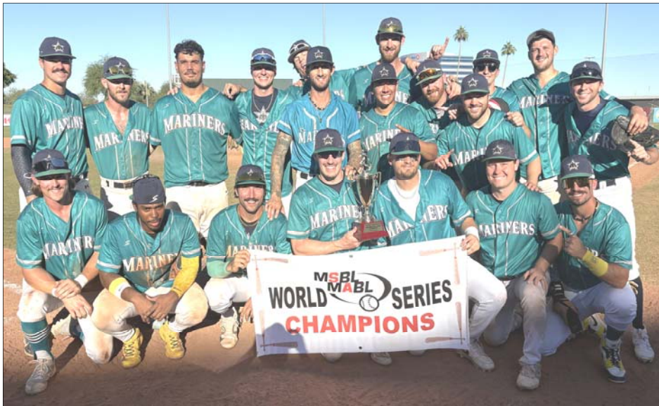
25+ Mountain Division Champions - Motor City Mariners