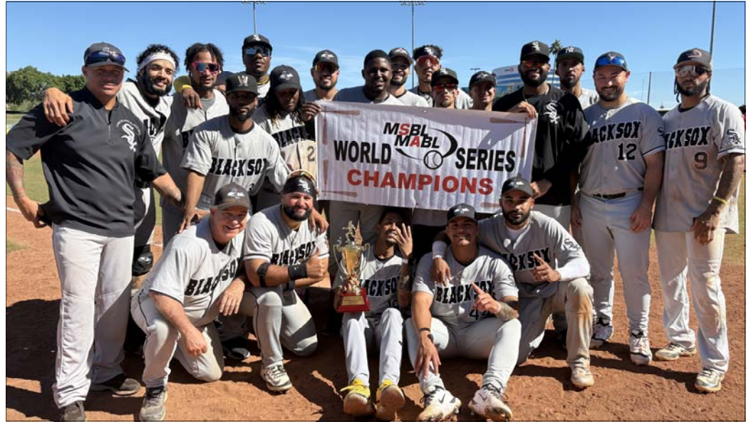
25+ National Division Champions - Long Island Black Sox