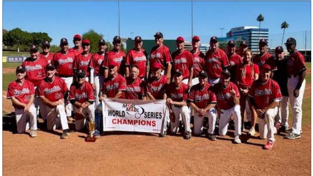
70+ National Division Champions - Minnesota Bandits