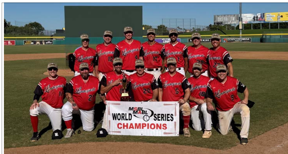
40+ Central Division Champions - Minnesota Lumber Jacks