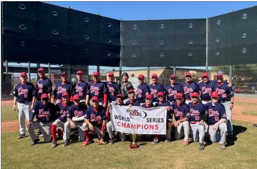
70+ Central Division Champions - Chicago North TSP's