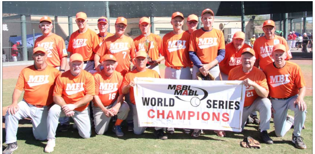
70+ Cactus Division Champions - MBI