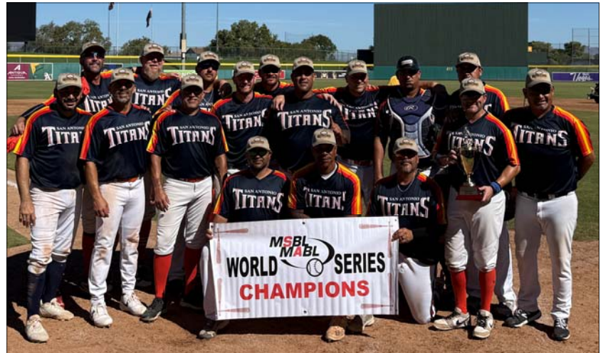
40+ Mountain Champions - San Antonio Titans